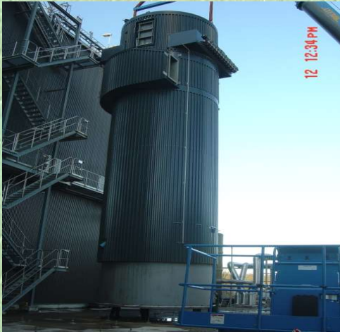
Mounting of Filter 1