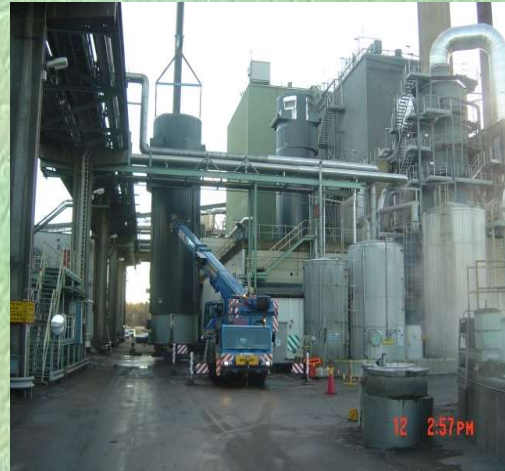
Mounting of Filter 2

The collected ash is handled in another delivery of Filcon (please see separate case story). A 600 m 3 silo with complete humidification system for the ashes is handling the capacity of approx. 2 days production af.