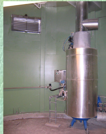
Pneumatic Conveyor below filter

The collected ash is handled in another delivery of Filcon (please see separate case story). A 600 m 3 silo with complete humidification system for the ashes is handling the capacity of approx. 2 days production af.