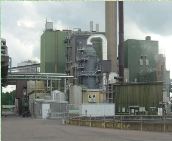
Existent Flue Gas Cleaning system.

Delivery of three new Filcon filter modules with Discharge screw conveyors, ducts, service platforms and complete pneumatic conveying systems for transport of the residues to the Filcon Ash silo. In addition, a lime silo is supplied which adds lime into inlet ducts via a lance. The lances are strategically positioned so that the lime is evenly distributed in the ducts and Bag Filter modules.